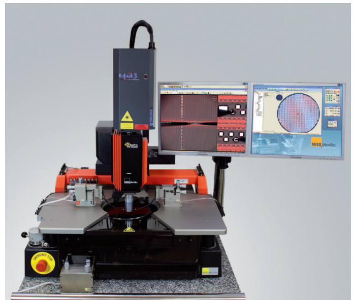
The digital video microscope iVista LC with laser cutter on a PA200 probe system.